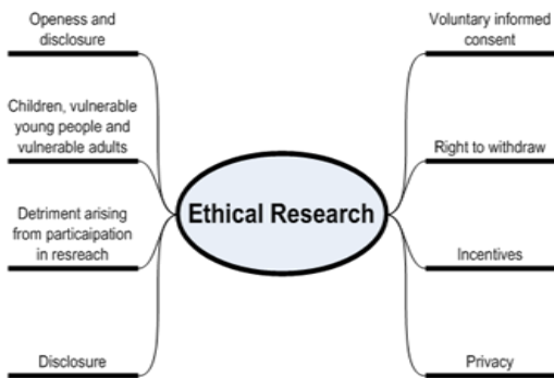
Figure 1 Ethical Research.

Figure 1 outlines BERA's (2018) ethical code of practice which has been applied throughout the course of this study. Newby (2010) outlines the researcher's responsibilities including academic honesty in relation to accurate reporting of the data collected and the level of researcher responsibility for others involved. Newby (2010) also questions whether researchers should report evidence of criminality. The participants in this study have authority over and access to young people and adults. In the case of this study, should any criminal activity or child protection issue have come to my attention during the research, I would have had no choice but to report such activity to higher authorities. I made this clear to the potential research participants before they were invited to participate. The college operates rigorous safeguarding policies to protect young people and vulnerable adults; I have a legal obligation to report any incident which may harm students of the college. I did however engage with a deontological approach, choosing not to disclose information to others when the participants made technical mistakes.