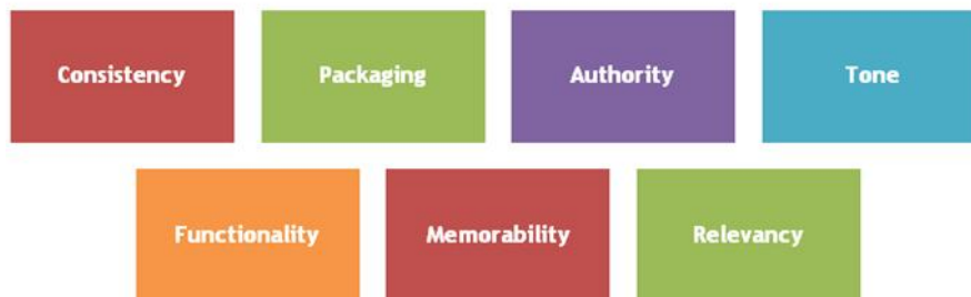
Figure 1 - Factors influenced by graphic design

Consistency is one of the most important factors in graphic design as designs are being shared across multiple marketing channels. The fit of graphic design in to that of the overall design of the marketing material plays an important role (Roberts, 2015).