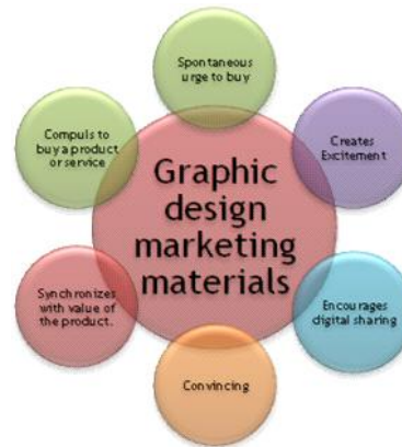
Figure-2 Graphic design and consumer behaviour