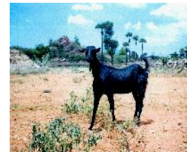
PLATE 1 SALEM BLACK-BUCK PLATE 2 SALEM BLACK-DOE

The mean body measurements and body weights of adult Salem Black goats are presented in Table 1.