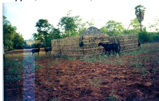
PLATE 3 : SALEM BLACK – SHED WITH RESTING PEN

The Salem Black was housed only during nights and the sheds were generally located near the houses of goat owners or formed part of the residence. Kids were housed separately in a special, round enclosure made up of Palmyra leaves and thorny bushes. The special type of accommodation for kids is called as kodappu (Plate 3 and 4).