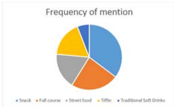
Figure 3 Type of Food Promoted by Bloggers for their Attractiveness