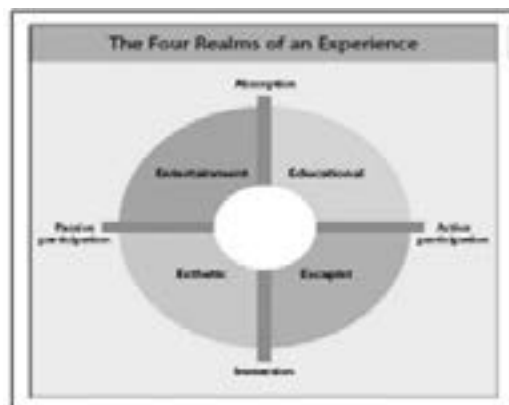
Figure 1. The 4Es of experience economy

Pine and Gilmore have put forward 4 Es - entertainment, educational, escapist and aesthetic or esthetic as four realms of consumer experience.